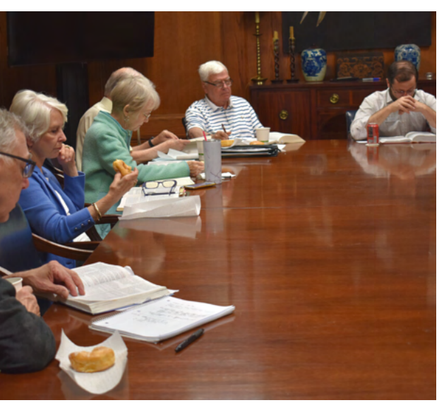
Rector's Tuesday Bible Study