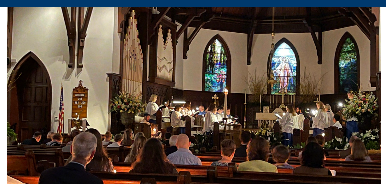
Easter Vigil by Candlelight