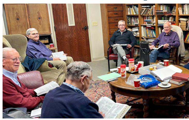
Senior Men's Bible Study