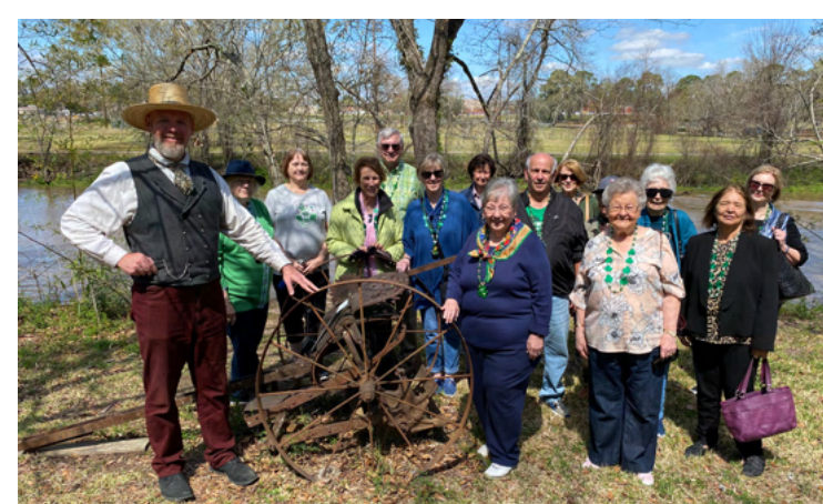
The James Gang