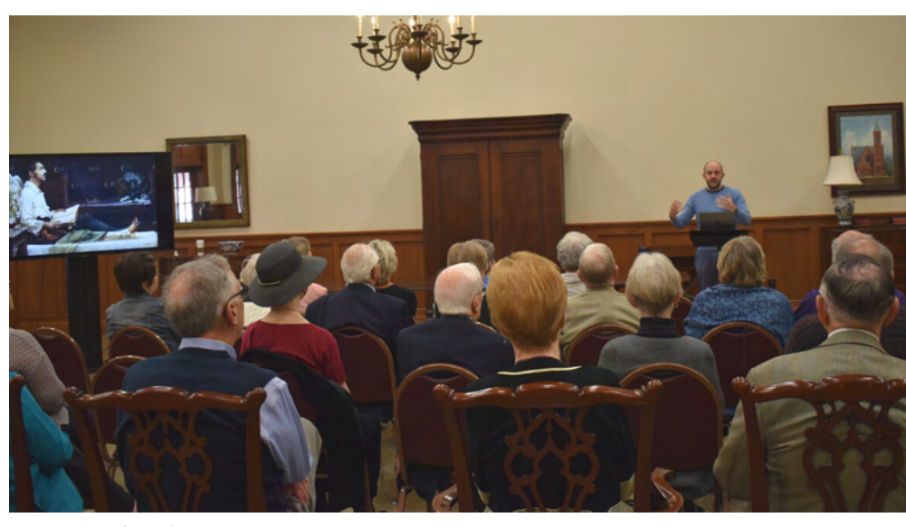
Adult Forum Prayer Practices in the Christian Religion