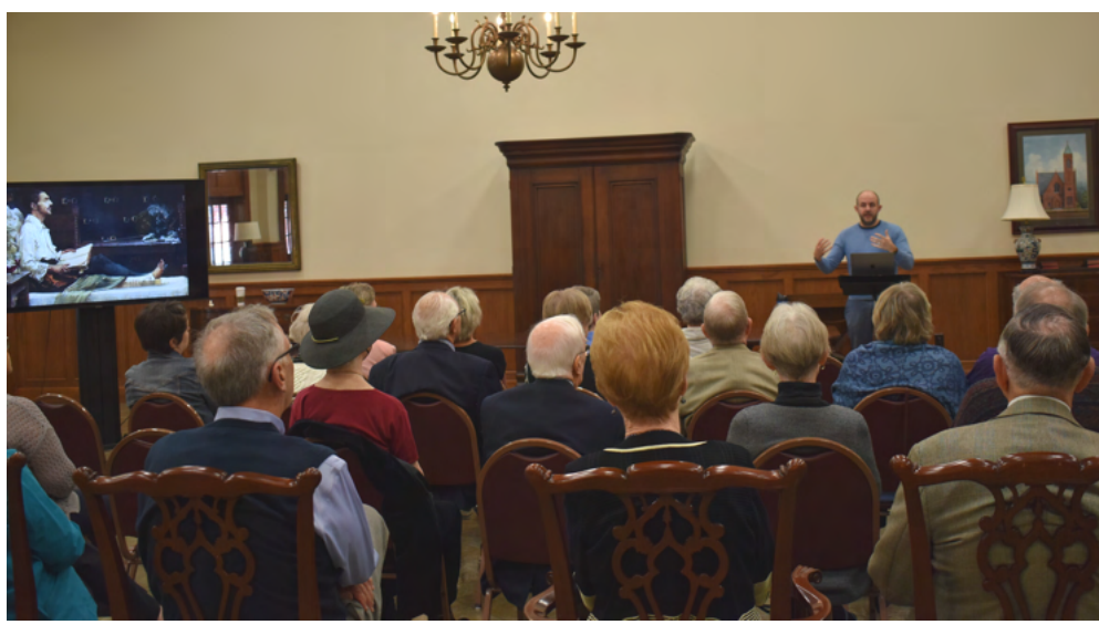
Adult Forum Prayer Practices in the Christian Religion