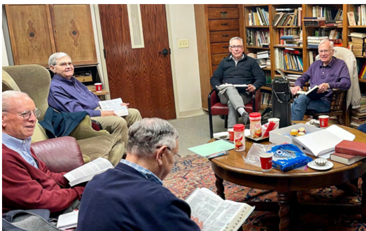
Senior Men's Bible Study