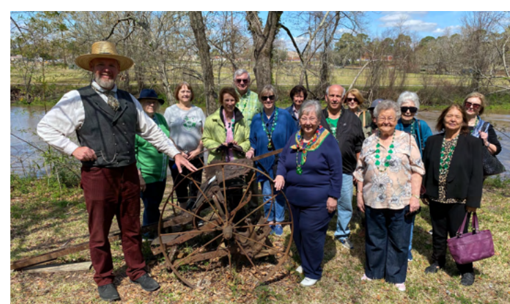
The James Gang