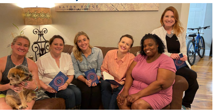
Saint Mary's Group